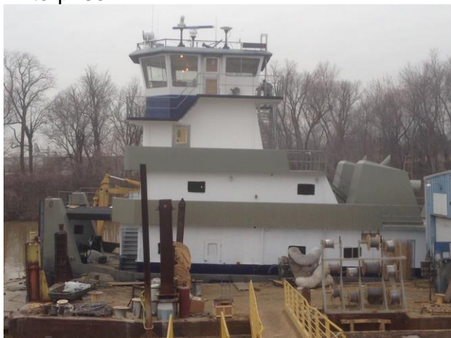
Fran C, Big Bend