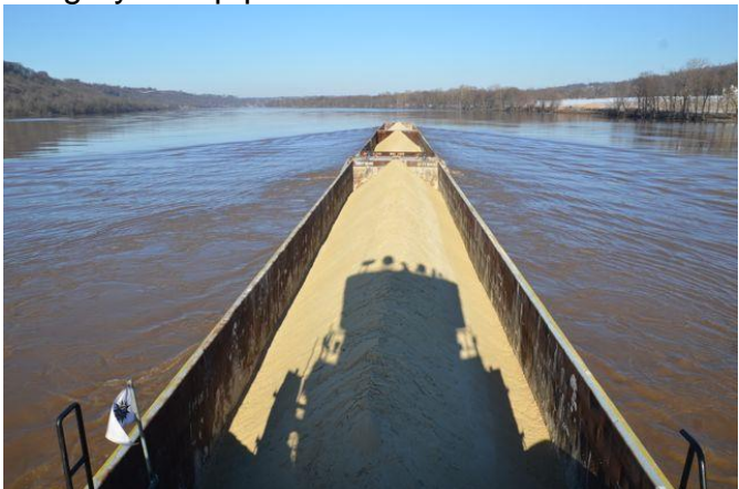
Papa Fred, Dry Dock