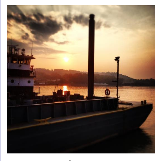
MV Discovery Construction