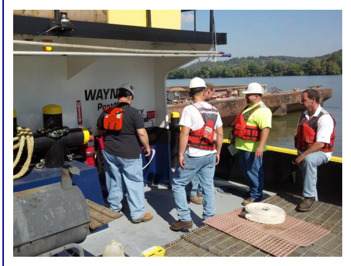
MV Enterprise Construction