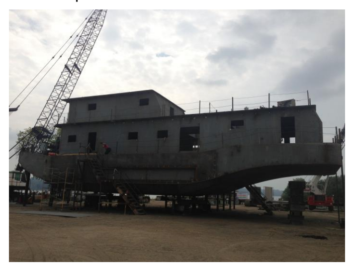
Trimble County Dredging